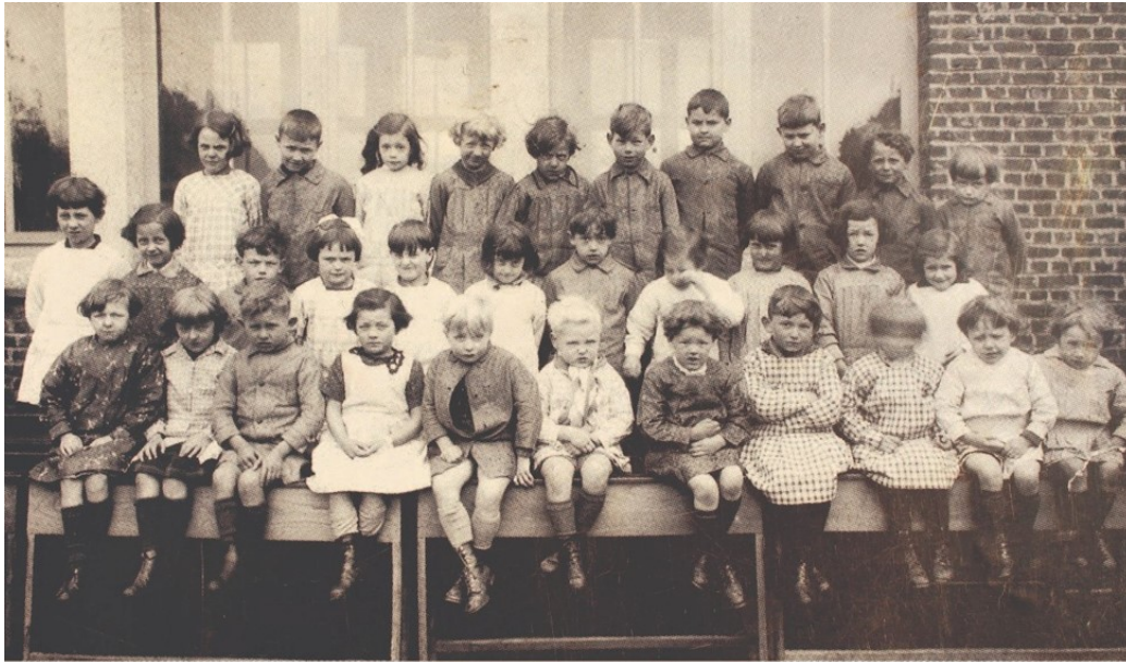
Ecole de Fromelles Rue de la Mairie 1936